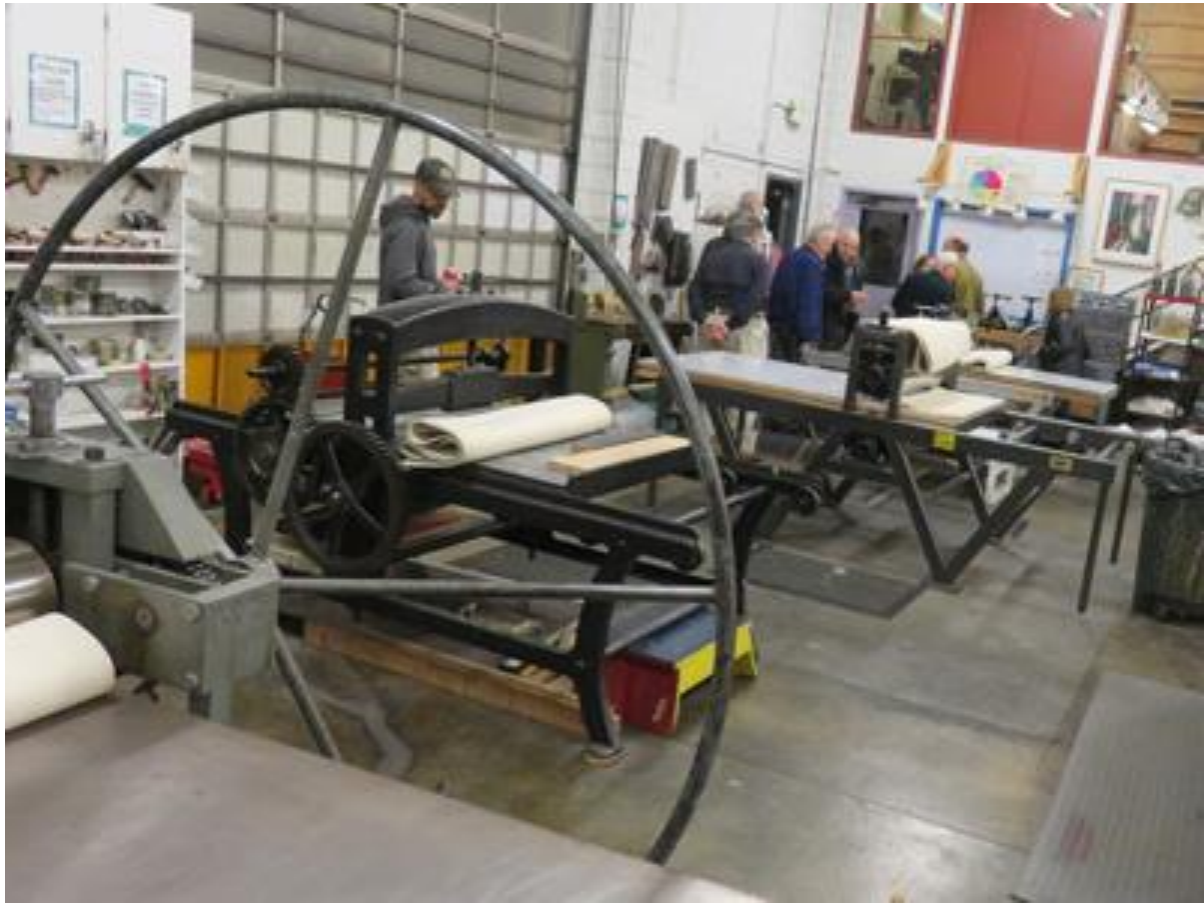
Printing and Textile Studio