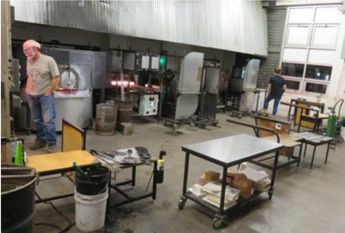
Hot Glass Shop