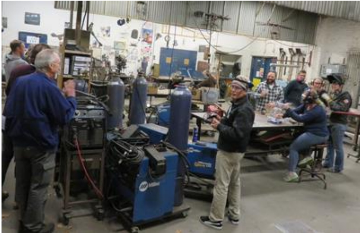
Metal Working Studio