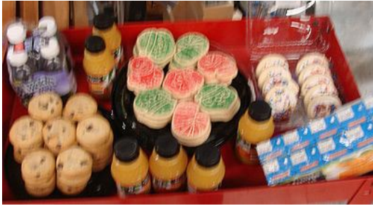
Refreshments by Rockler