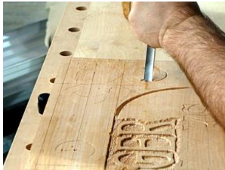
Setting in the pattern