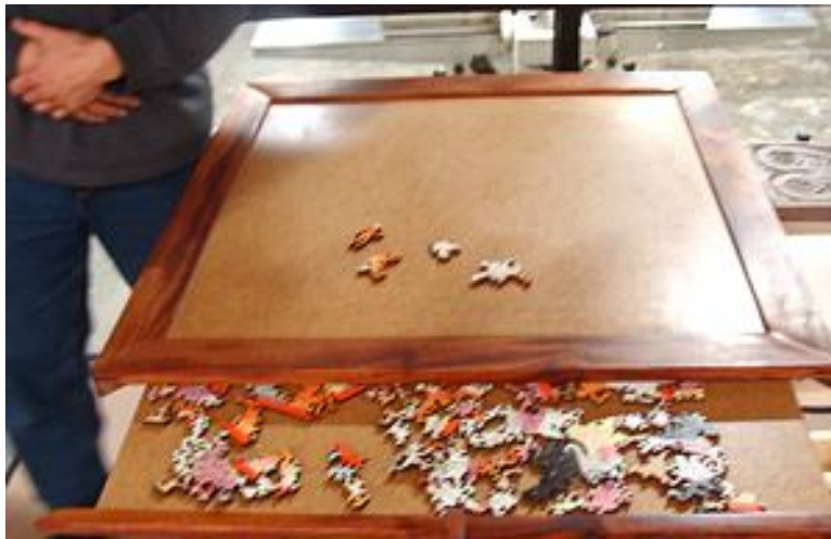
Chris Yee's lovely puzzle holder with storage drawer