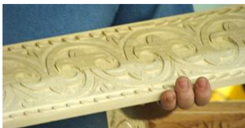
Repeating Fleur-de-lis Pattern