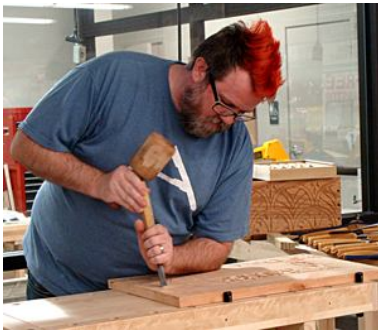
Using a gouge to establish a rounded shape

He also demonstrated some of the techniques he uses to produce his intricate patterns by using a sequence of operations as shown below.