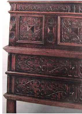
Photos of Antique Flat Relief Carvings