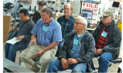
Intently watching the presentations