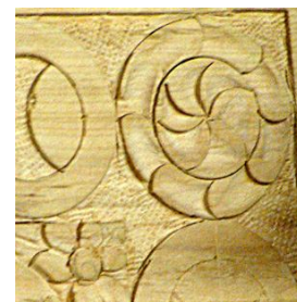
Rosette highlighted with shallow gouge