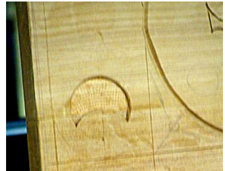
Flattened & textured shape