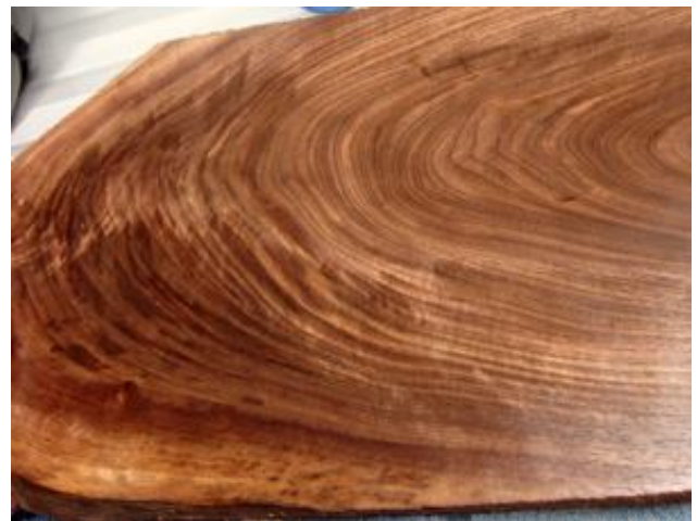
Odie's Oil finish on a walnut burl

We were impressed with the ease of application and finished appearance of this product – definitely worthy of usage on some of our future projects. Thanks, Bob , for the presentation.