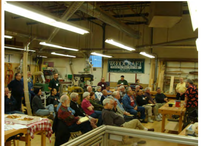
May Meeting